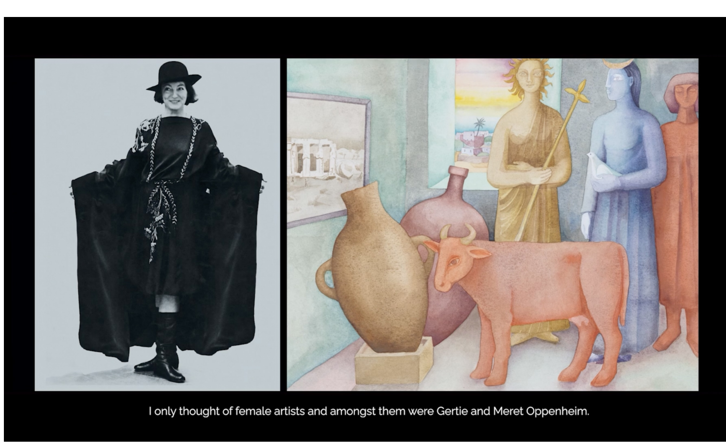
WHAT IS HAPPENING?